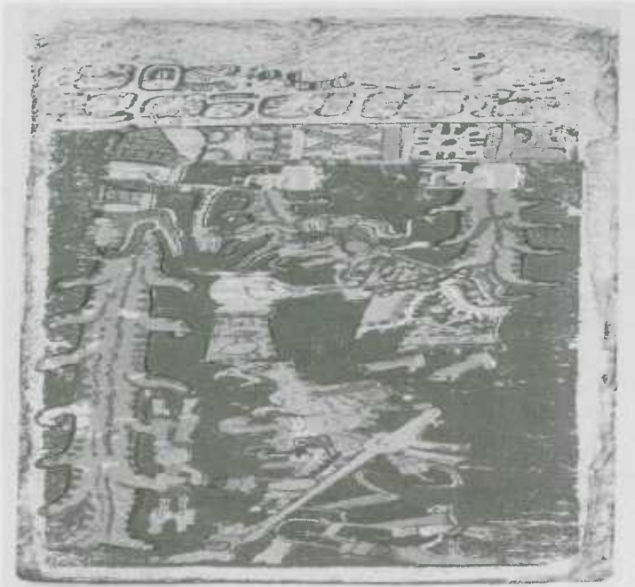
Figure 5. Last page of the Dresden Codex

This takes us back to Tortuguero's Monument 6. Using the information gathered from Maya inscriptions here and there and a diversity of Mesoamerican traditions, the stone tablet has been read in the following way (notice the interpretation in the bracketed text):