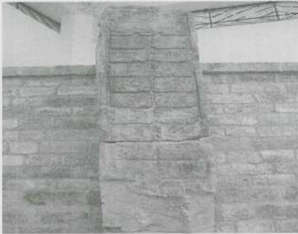
Figure 3. Stela 64. Copan, Honduras

It seems that the end of the calendric cycles was important for the Maya. For example, the Stela 63 in Copán (Honduras) highlights the date 9.0.0.0.0 (A.D. 435). [See Figure 3]