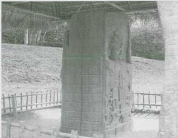
Figure 4. Stela C, Quiriguá Guatemala.

Similarly, the impressive Stela C in Quiriguá (southeast Guatemala) affirms that the kingship of Cauac Sky (A.D. 724–785) was rooted in the moment of the most recent creation 13.0.0.0.0 (3114 B.C.). [See Figure 4]