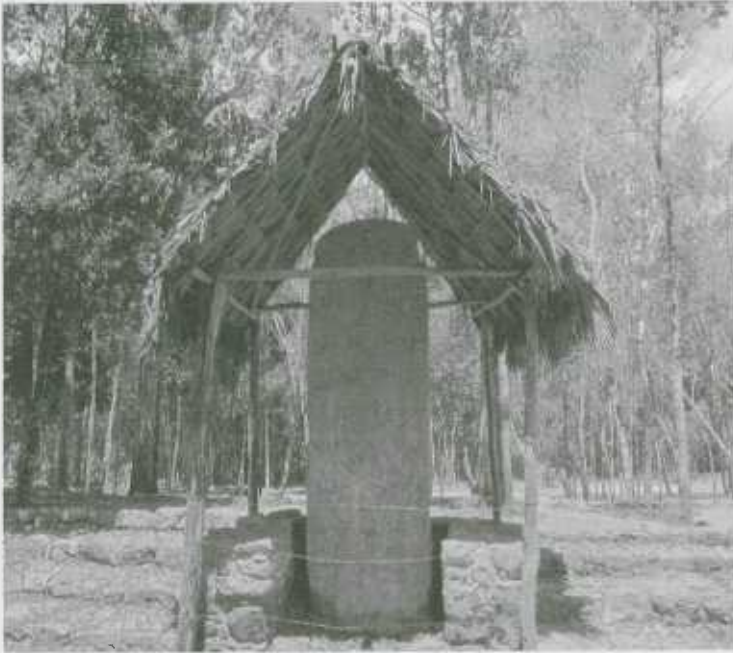
Figure 7. Stela 2 at Coba.

México, have very interesting inscriptions. [See figure 7] Both mention the creation date (13.0.0.0) but prefixed by 19 units of 13. This means that the creation date was in fact an abbreviation of a still longer date. This equals 8,285,978,483,664,581,446,157,328,238.631 years of elapsed time from the true beginning of time in Maya conception of the cosmos. That is 28 octillion years in the past. Now, if we extend to the future, the Maya Calendar projects 43 octillion years (43,517,152,096,098,311,708,523,306,538). That is well beyond the time that according to scientific calculations our sun will cease to exist. 52