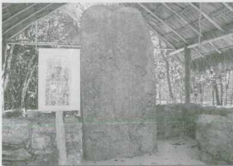
Figure 6. Stela 1 at Cobá.

5. Maya believed that the world existed before 3114 B.C. and would continue to exist after A.D. 2012. The Long Count date of December 21, 2012, is 13.0.0.0.0. Did the Mayas expect further events after that date and/or how would they record these events? The Long Count Maya calendar works like the odometer of a car. The date 13.0.0.0.0 will be also 0.0.0.0.0 and will mark the beginning of a new cycle. The Stela 1 at Cobá also shows that Maya would add an extra digit indicating the beginning of a new age in the calendar. [See figure 6] Thus, December 22, 2012 will be simply 1.0.0.0.0.1 and it would continue as time marched indefinitely. Did the Mayas expect events to happen after this date? Yes, they did. One glyphic text in the Temple of the Inscription at Palenque, Chiapas, celebrated that the 80 th round calendar anniversary of the reign of the great king K'inich Janaab' Pakal (known as Pakal) would take place eight days after the end of a 8,000-year Long Count cycle called the pictun . This refers to October A.D. 4772, almost three millennia after 2012. Evidently, the Mayas did not believe that the world would end in 2012.